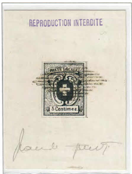
type A1 with static cancel