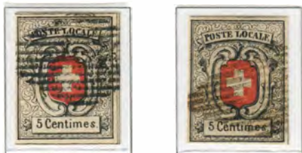
types A1 and B1, type A always has static cancel, both with type 1 crosses

Sperati reproduced the "Neuchatel" 5c stamp including uses on covers and on fragments. Two clichés were used for printing, the main design in two types and the central cross in two types. The type 2 cross has not been documented before. All cancels and markings are forged.