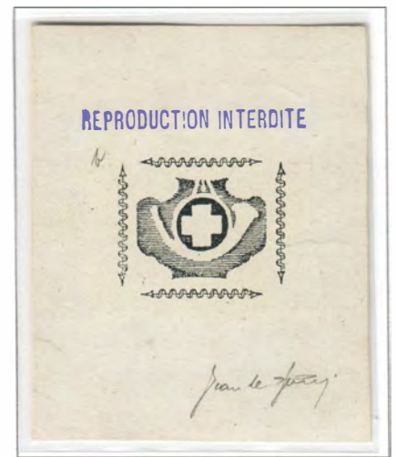
type 2 background