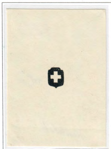
type 1 cross (spike on left arm)