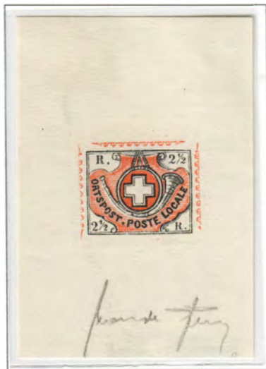
type A1 proof in color