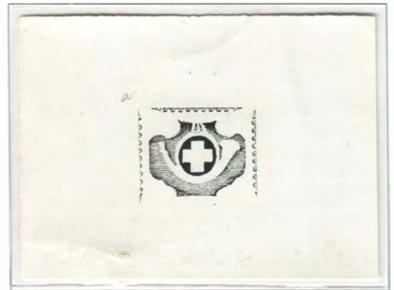
type 1 background