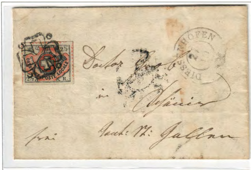
type A1 on folded letter with Zurich rosette cancel