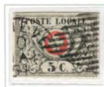
rosette, grid and grill cancels