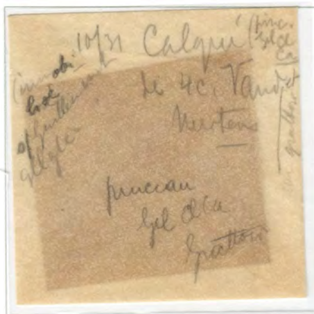
ink tracing of 4c value tablet and protective encasements dated October 1931