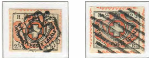
types A1 with rosette cancel and type B2 with forged Munsingen grille cancel

Sperati reproduced the "Winterthur" stamp including uses on covers. Two clichés were used for printing, the black design portion in two types and the red background in two types. Type A design always has type A background while type B always has type 2n background. All cancels and markings are forged.