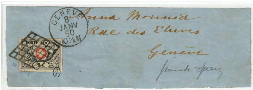
type A on partial cover, "Copie" handstamp of Chambéry court, illustrated in Sperati I , plate 103

Sperati reproductions on cover feature all the forged "trimmings" as Sperati termed them. The cancels, postmarks, sender cachets and even the wax seals on flaps are forged.