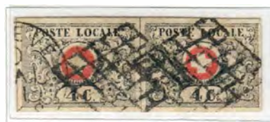
type B pair