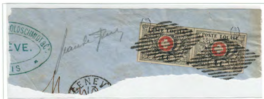
type B pair on piece, "Copie" handstamps