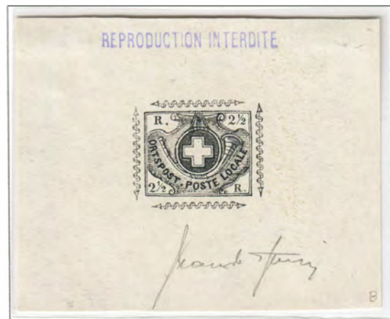
type B2 black proof