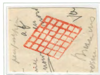
working proofs of Geneva grid cancels