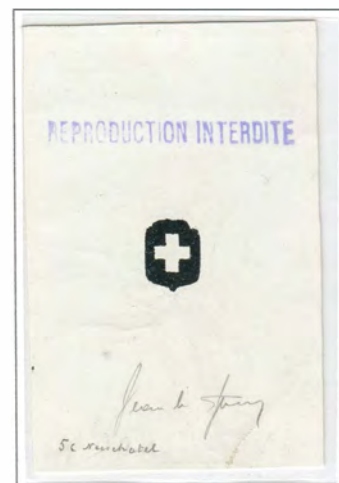
type 2 cross (no spike)