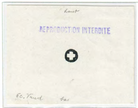
proof of cross red background