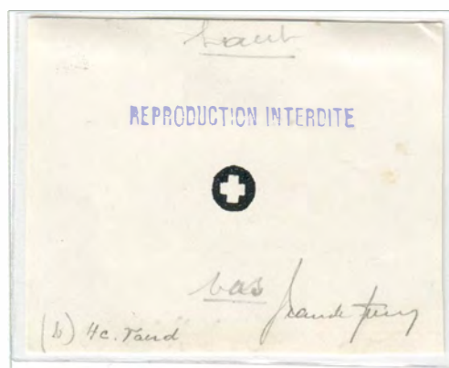
type B composite proof and proof of red background only