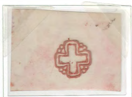
cliché to print Geneva rosette