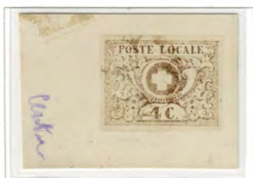
exposure trial, type B