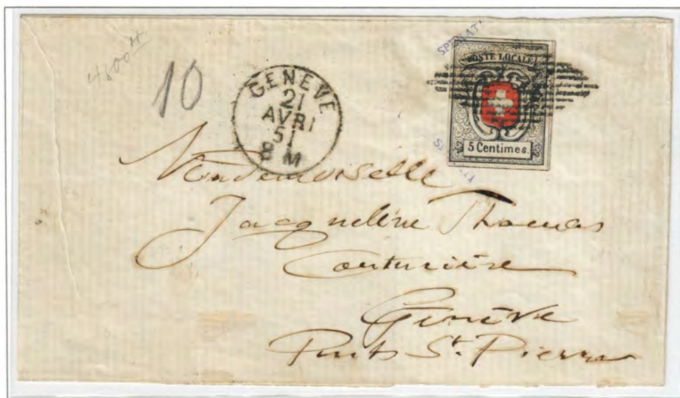
type A1 (design type A, cross type 1) on large part cover, all markings are forged